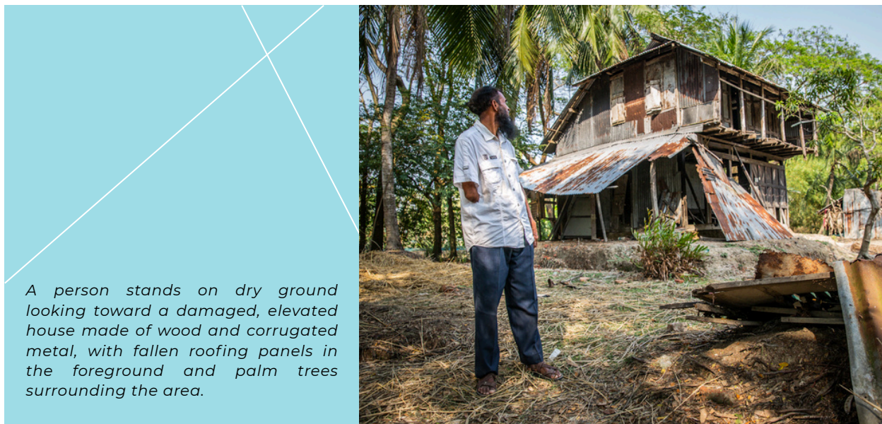
A person stands on dry ground looking toward a damaged, elevated house made of wood and corrugated metal, with fallen roofing panels in the foreground and palm trees surrounding the area.

With contributions from the International Disability Alliance (IDA), International Federation of the Red Cross, (IFRC), CBM Global, and regional Organisation of Persons with Disabilities (OPD) partners, the event highlighted a growing global movement: one that is determined to ensure people with disabilities are not only protected in disasters, but recognised as leaders in shaping safer, more inclusive societies. Read more about progress toward a treaty here .