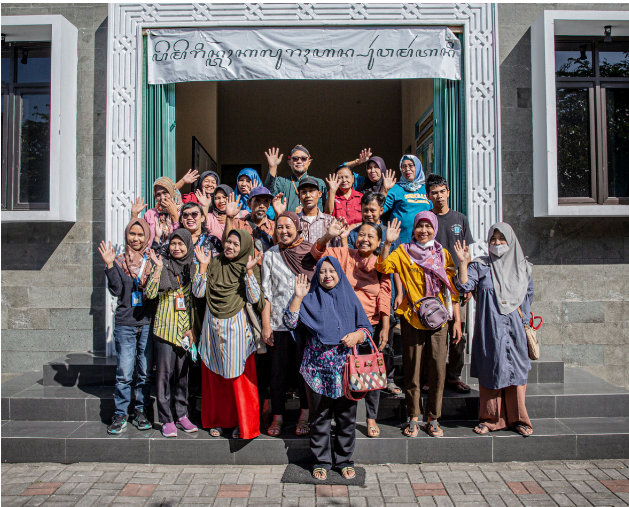
A group of around 18–20 people stand together at the entrance of a grey building, smiling and waving toward the camera. The group is gathered on steps beneath a rectangular doorway framed by a decorative white border, with a banner above the entrance displaying text in a non-Latin script

A full copy of the report may be accessed here .