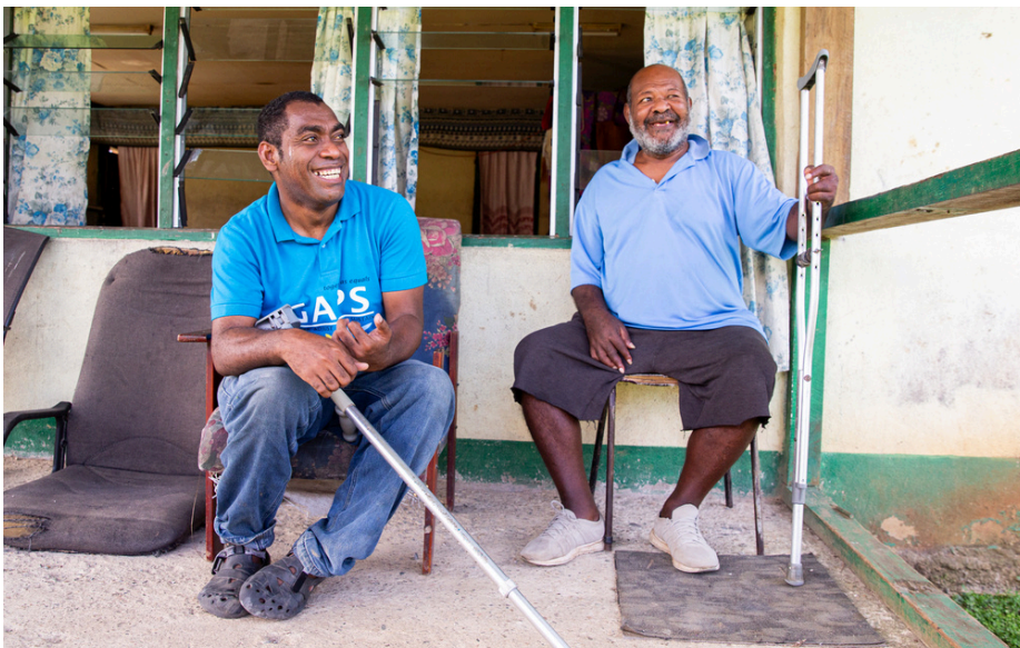
Two people sit outside a building with crutches beside them, smiling and talking near an open window.