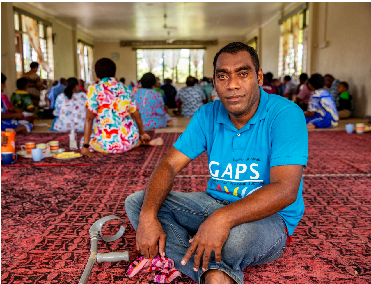
Person wearing a blue "GAPS – together as equals" shirt sits on a patterned floor with a crutch nearby, while a group of people gather and share food in a hall behind them.